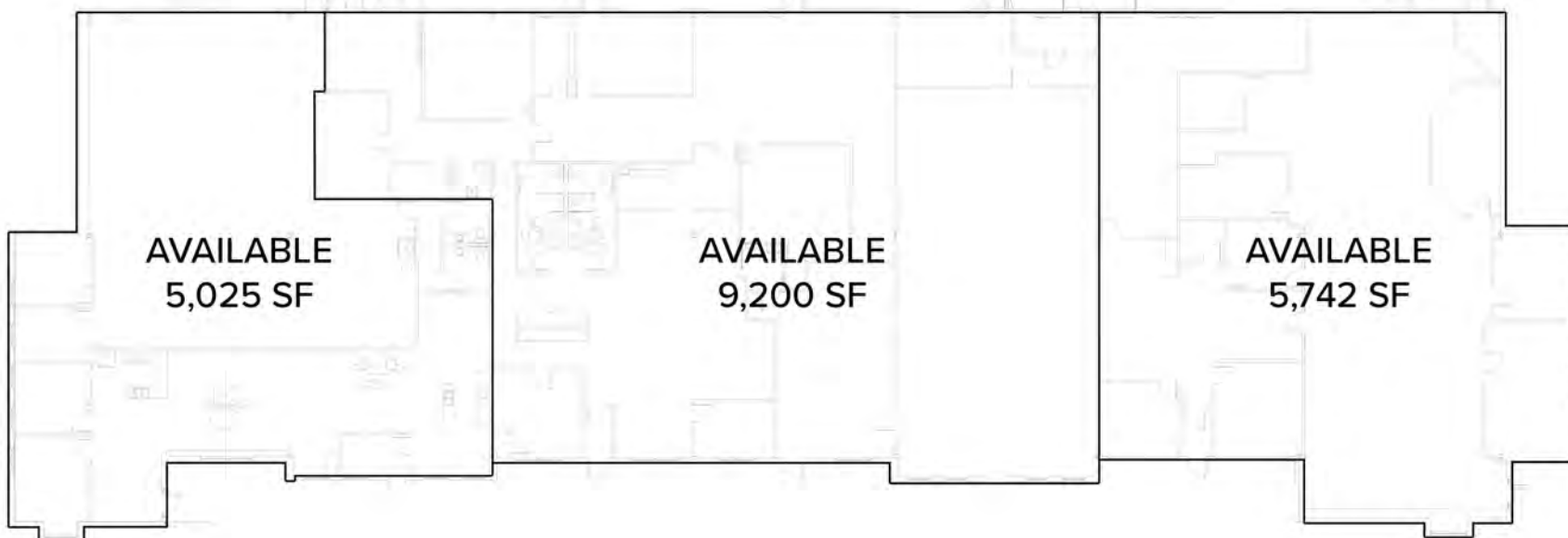
Building C Available Suites (Total Building approx. 20,000 SF)