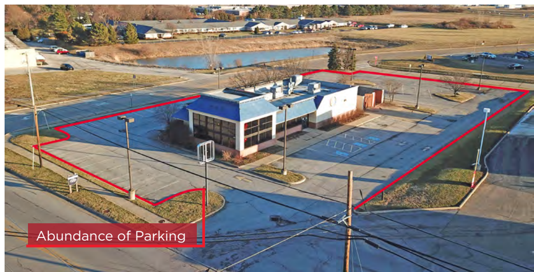
Abundance of Parking