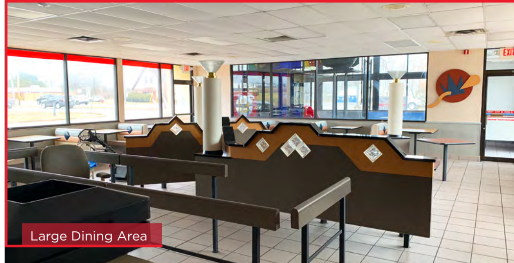
Large Dining Area