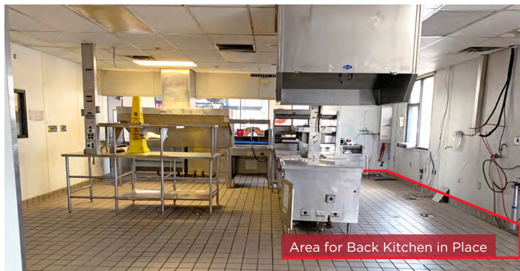
Area for Back Kitchen in Place