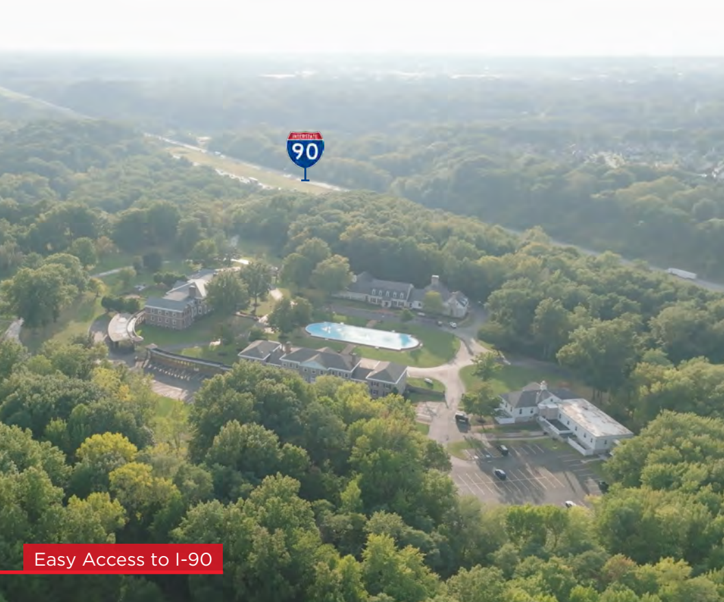
Easy Access to I-90