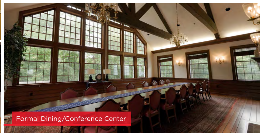
Formal Dining/Conference Center